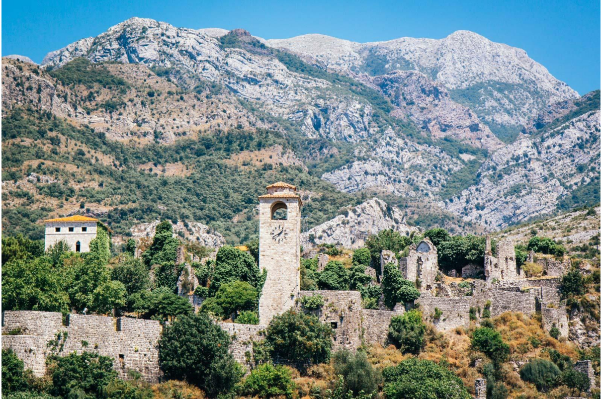
Stari Bar, old town of Bar

The old town of Stari Bar, the first stop on the Hashbus has seen its fair share of troubles. Over the centuries it was taken over by the Venetians, the Serbians, the Hungarians and the Ottoman Empire. The scene of a siege in 1877, it was finally reclaimed by Montenegro from the Turks after the locals bombed the aqueduct into the town and cut off the water supply.