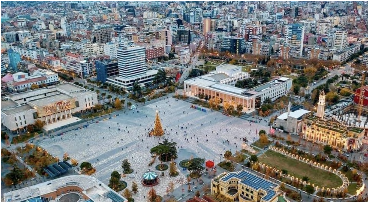
Tirana, Skanderberg square - Lot boutique hotel is out of picture to the right

Sulejman Pasha Bargjini, established the city in 1614. His first constructions were a mosque, a bakery and a hamam (why not a brewery?). Tirana was proclaimed capital in 1925.