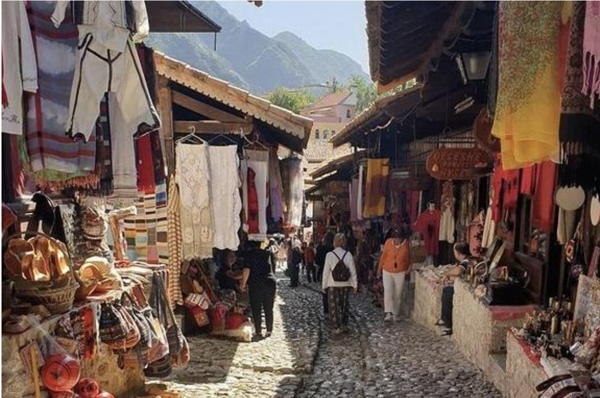
Krujë, Old market

Krujë is a small old city that has been populated since the 3rd century BC, it was also home to the eponymous Alban tribe which gave name to the country as well as Gjergj Skanderbeg, the national hero of Albania.