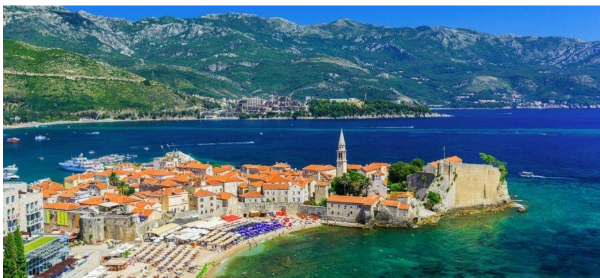
Budva, Astoria Hotel in bottom left corner behind the wall

Budva is a coastal tourist resort in Montenegro. It is often called Montenegrin Miami , because it is the most crowded and most popular tourist resort in Montenegro with beaches and vibrant nightlife. Budva is developed around a small peninsula, on which the old town is situated. There are as many as 35 beaches in the Budva area. So if U have some spare time before the craziness begins U can plunge in the sea and be lazy at one of the beaches. Maybe try to get lost in the old town or walk the city walls or venture away and walk along the boardwalk to Mogren beach or take a quick boat trip to Hawaii (yez, relly).